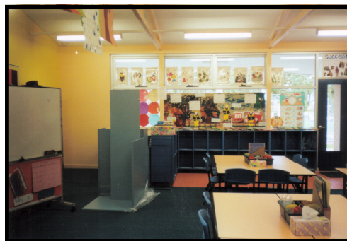
Inside a new classroom.

In 2001 a new building was completed. The result was a very modern, comfortable, functional building with bright and open classrooms. The rooms have heating, air conditioning, net-worked computers, withdrawal room and internal phone communication.